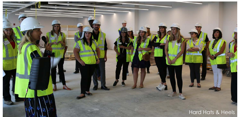
Hard Hats & Heels