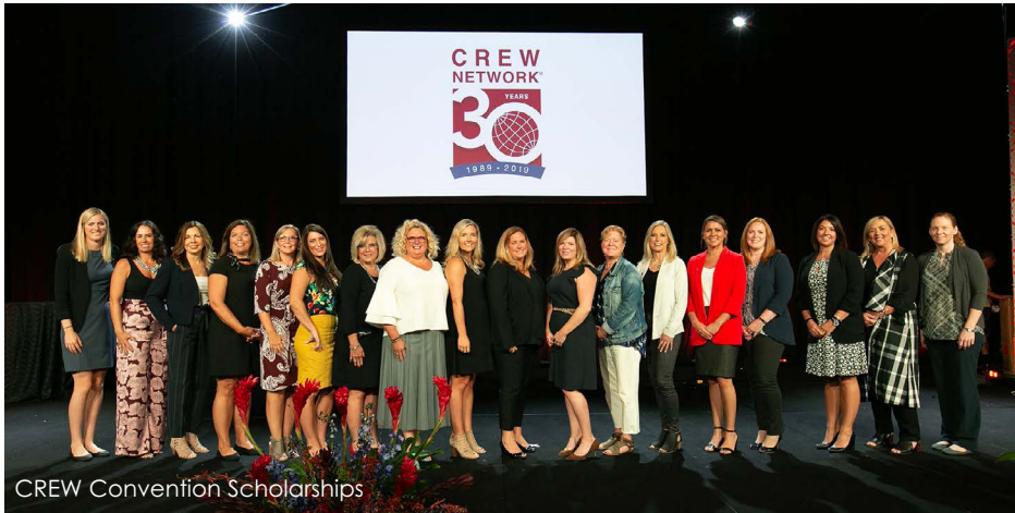
CREW Convention Scholarships