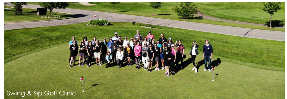
Swing & Sip Golf Clinic